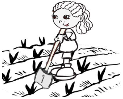
Fruits and vegetable plants are growing <u>2</u>

Fruits and vegetables are ripe for picking at the farm \underline{3}